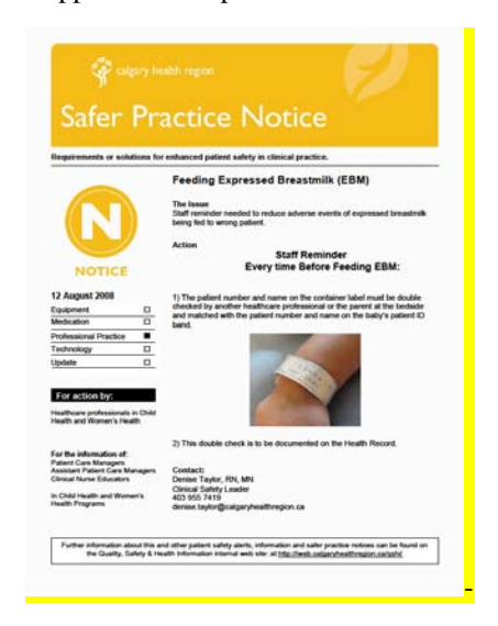
Figure 5. Safer Practice Notice

A "Safer Practice Notice" (see figure 5) for "Feeding Expressed Breast Milk (EBM)" issued August 2008 and distributed throughout the ACH identified the need to verify the patient number and name before feeding EBM and to document this check. However, no visible prompt in the chart for a double signature was implemented. Staff did not relate any knowledge of an actual EBM mix up that would have prompted the Safer Practice Notice. At the time of the incident of March 31, 2009, the Safer Practice Notice was still taped to the fridge but it had faded reducing its legibility. Other than the Safer Practice Notice, the Review Team had difficulty determining if the 11 recommendations were implemented as no progress report to the recommendations was made. Some changes in practice were observed that aligned with some of the recommendations but a standardized approach to implementation of the recommendations was not evident.