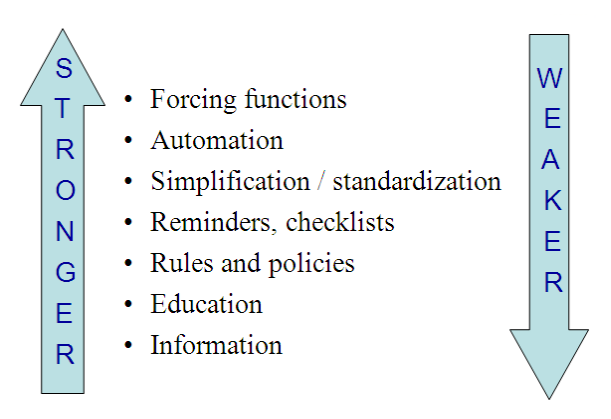
Figure 1. Hierarchy of Actions

All activities of the RCA including development of causes, contributing factors and recommendations are arrived at by consensus of the RCA team.