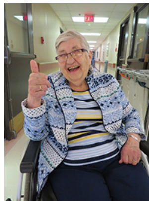
Continuing care patient